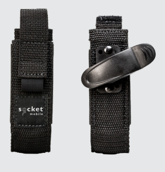
Safe and accessible placement