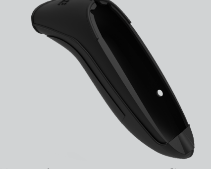
Keeps the scanner at your fingertips