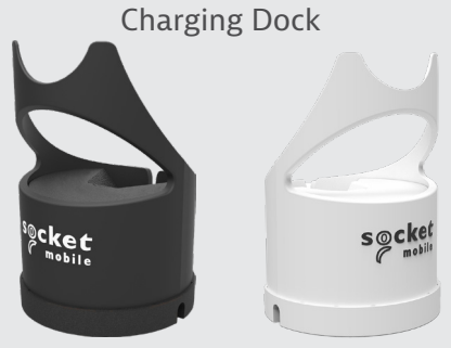
Ideal as a desktop charger