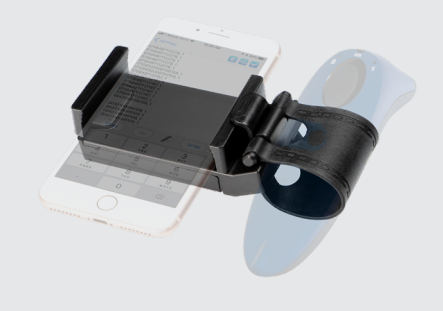
Nice one-handed option