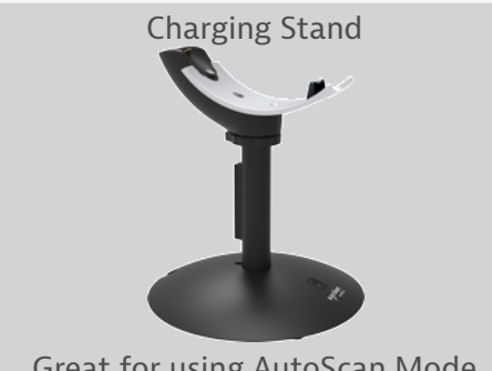
Great for using AutoScan Mode